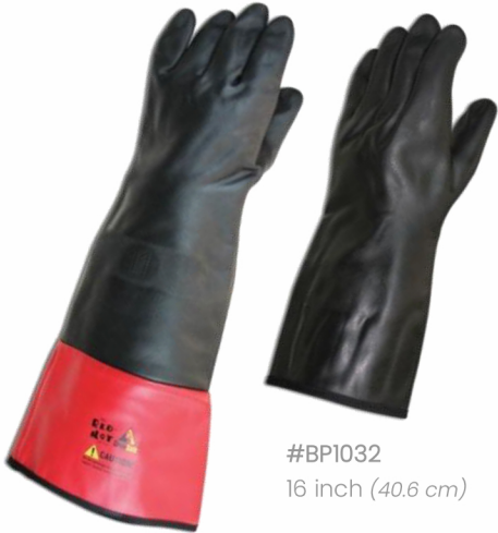
#BP1010 20 inch (50.8 cm)