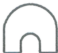
60 x 66 Horseshoe