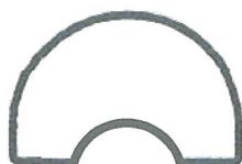
48 x 72 Kidney