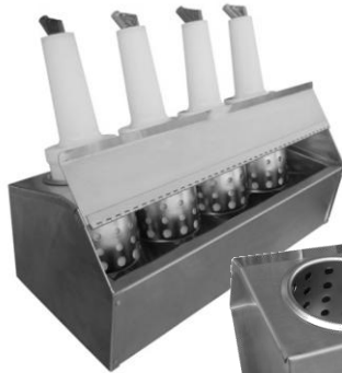
Model #: CC-LTC-4BR Rear view, bottles not included