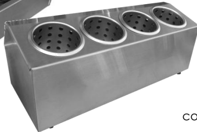
Model #: CC-LTC-4BR

See below for a complete list of available models.