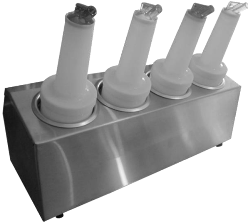
Model #: CC-LTC-4BR (Bottles not included, by others)

See next page for a complete list of available models.