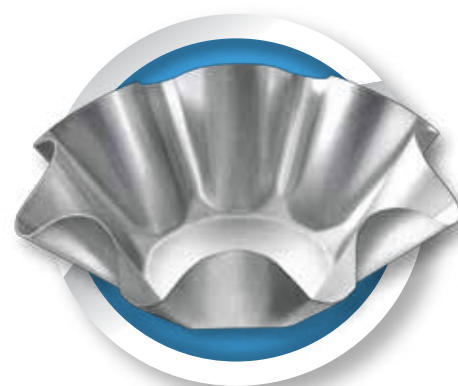
Tortilla Shell Pan Coated with AMERICOAT® Plus