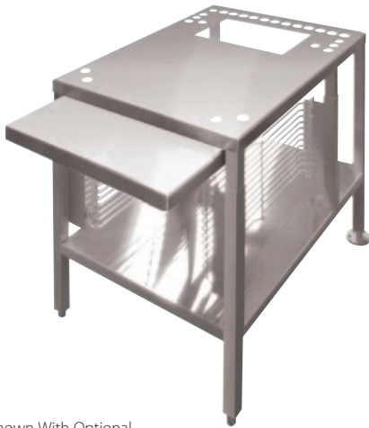
Shown With Optional Pan Rack Kit & Pullout Shelf