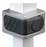
Toggle Leg Adjustment System