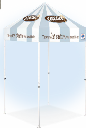
5' x 5' (1.5 m x 1.5 m) VUE™