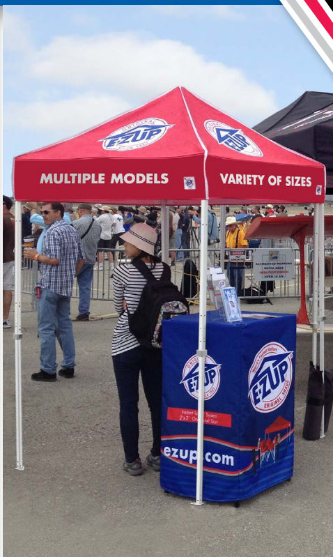
*Shown with imprinted top and valance.

The new VUE™ Professional Shelter is packed with new features. It's the perfect promotional tool to maximize branding when space is limited.