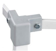
High Strength End Cap for Greater Durability