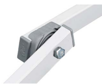
E-Z Glide Truss Washers Allow for Increased Stability