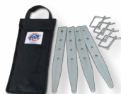
HEAVY-DUTY STAKE KIT