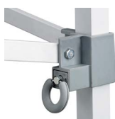
Pull Pin Slider for E-Z Quick Lock and Release