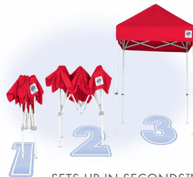
SETS UP IN SECONDS™

#1 Best Selling Instant Shelter® in the World™