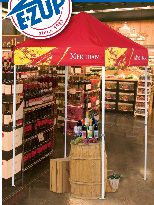
*Shown with digital valance.