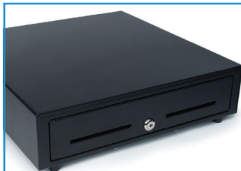
Standard Size 13.0"(W) x 13.2"(L) x 4.1"(H)