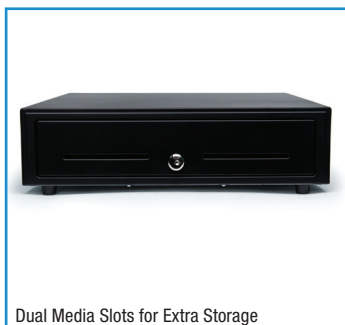
Dual Media Slots for Extra Storage