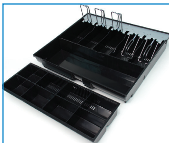
4 Bill / 5 Coin – 3 Bill / 5 Coin (Canada)