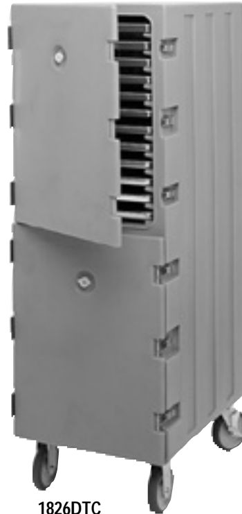
1826DTC (For Trays & Sheet Pans)