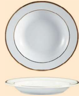
SOUP PLATE GRY-3 9"x1⅝"/10oz/2dz