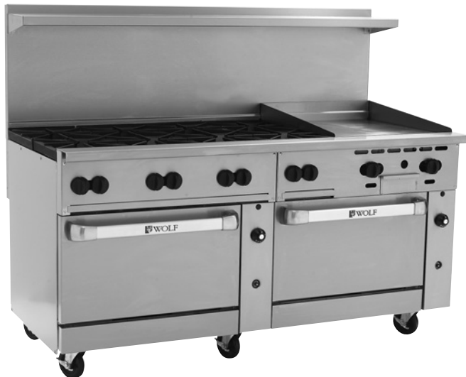
Model C72SC-8B24GN (shown with optional casters)