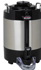
TF SERVER, 1.5G/5.7L MECH NOBASE