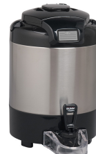
TF SERVER, DSG2 1.5G SST CD NOBAS