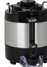
TF SERVER, 1G/3.8L MECH NOBASE