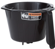
FUNNEL ASSY, SMART COFFEE BLK-CLEARED