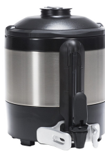
TF SERVER, 1G MECH NOBASE GEN3