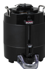
TF SERVER, 1G/3.8L MECH BLK NOBASE