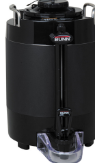
TF SERVER, 1.5G/5.7L MECH BLK NOBASE