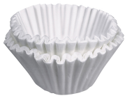
FILTERS, GOURMET 500 500/1 50/CL Product #: 20138.1000