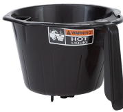
FUNNEL ASSY, SMART COFFEE BLK-CLEARED Product #: 53463.0021