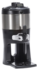
TF SERVER, 1G DSG GEN3