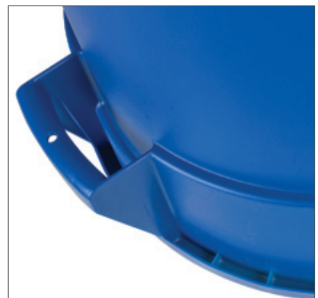
Sturdy Comfort Curve™ handle; support ribbing on can rim for added strength