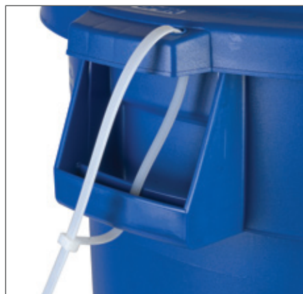
Holes in lid and handle allow you to securely attach lid to can