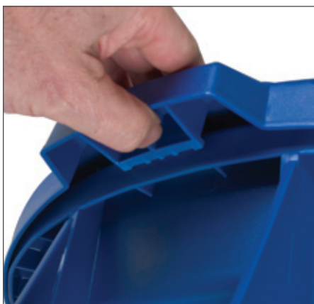
Lid notch secures lid to can