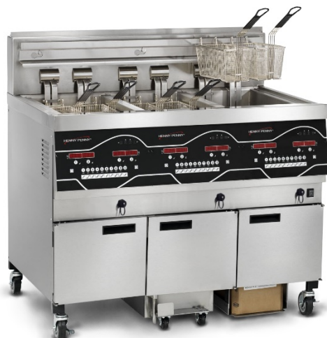
EEE-143 Evolution Elite Fryer with Smart Touch Filtration™