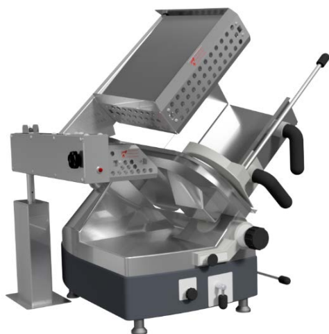
Model BW4B-1 (Slicer not included)

The Marshall Model BW4B-1 Slicer Warmer features patented ThermoGlo™ heating technology. Heat radiates from every square inch of the upper and lower flat plate surfaces maintaining uniform holding temperature and improved moisture retention for up to 45 minutes. The upper heat plate centers over the meat while the lower plate provides heat to the sliced meat as it falls onto the slicer landing area.