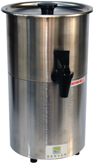
SY 1.0 ARBY'S 85503