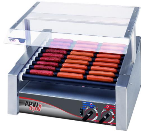
Model: HRS-31S Roller Grill with SGXP-31 Sneeze Guard