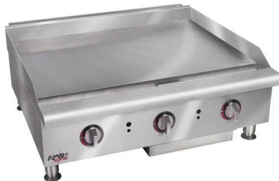
Model HTG-2424i Heavy Duty Thermostatic Griddle