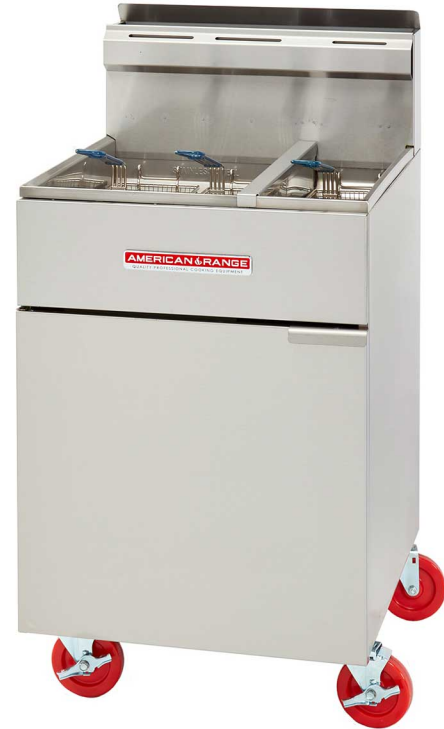
Model Shown AF-50/25