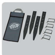
Heavy-Duty Stake Kit