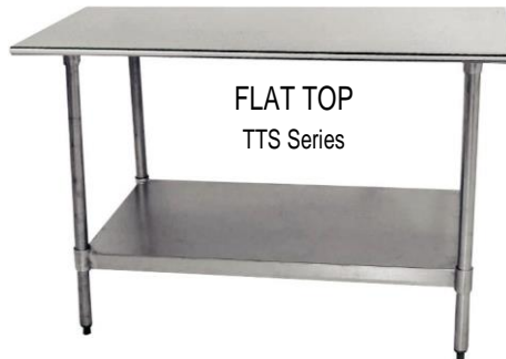
FLAT TOP TTS Series