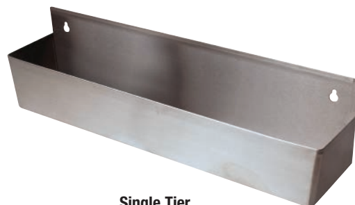
Single Tier BK-2 Shown