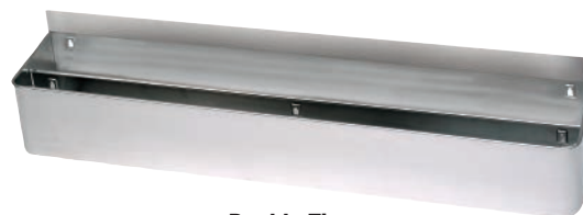
Double Tier DT-4 Shown