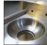
K-460A Disposal Cone w/ Control Bracket & Faucet Holes