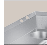
K-37 Anti-Siphon Vacuum Breaker Holes