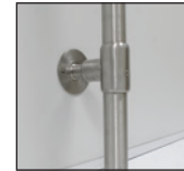
K-72 Leg-To-Wall Brace