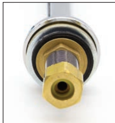
BOTTOM VIEW 1/2" NPS MALE INLET

Brass chrome plated body & spout. Chrome plated handles.