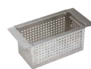
A-23 Fits 6" x 11" x 6" Sink