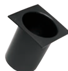
A-19 Single Bottle Rack 5 1/4" x 5 1/4"