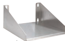
A-24 8" x 8" Add-On Blender Shelf w/ Duplex Outlet Hidden Beneath Shelf