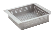
A-17 Fits 9 1/2" x 11 1/2" x 6" Sink