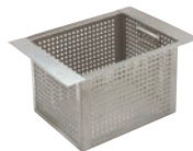
A-16 Fits 10" x 14" x 10" Sink