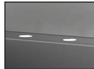
8" O.C. Deck Mount Faucet Holes Provided

Faucet are not included (see accessories).