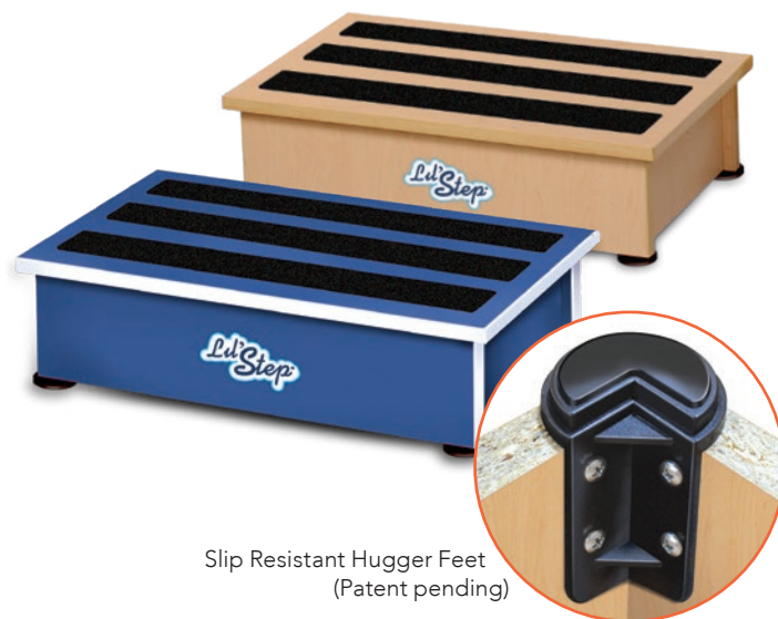
Slip Resistant Hugger Feet (Patent pending)