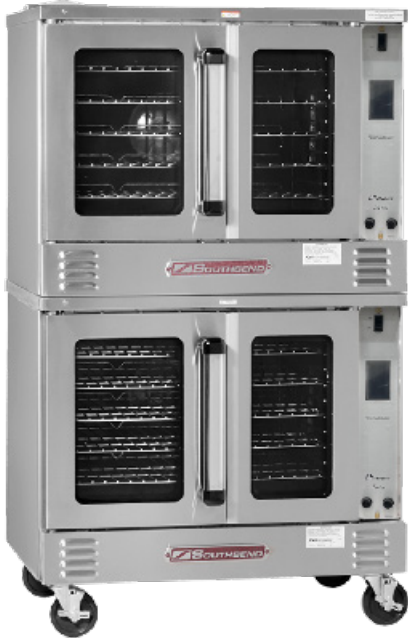
PCG100S/T-PRO shown with optional casters