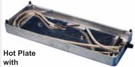
Hot Plate with Heating Element