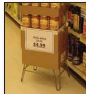
Ideal for Dishroom Chemical Stand