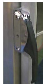
Magnetic Door Latch

Laboratory Certification and Approval Symbols: