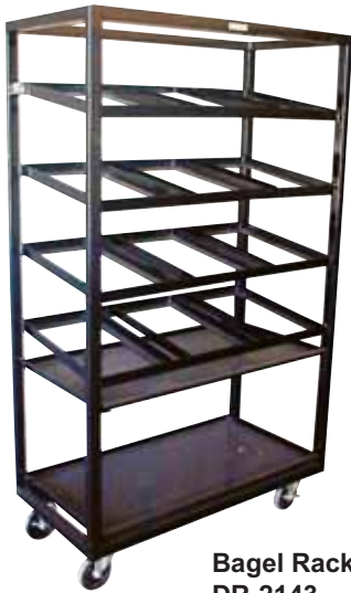
Bagel Rack DR-2143