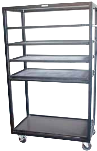
Bread Rack DR-2443