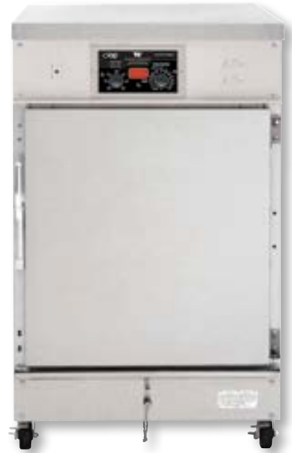
HA4511 CVAP® HOLDING CABINET HALF SIZE MODEL, WITH FAN Electronic Differential Control

CVap equipment complies with domestic and international requirements such as UL, C-UL, UL Sanitation, CE, MEA, and others.