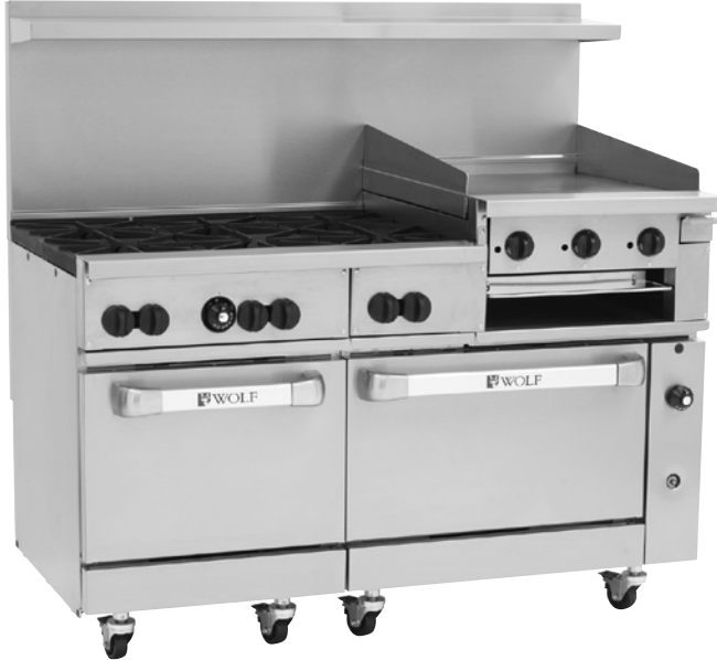
Model C60SS-6B24GBN (shown with optional casters)