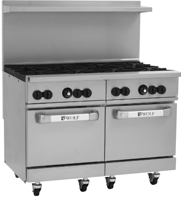
Model C48SS-8BN (shown with optional casters)