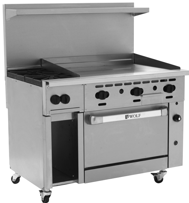
Model C48S-2B36GN (shown with optional casters)