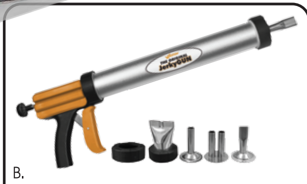
The Original Jerky Gun holds up to 1 1/2 lb (0.68 kg) of ground meat