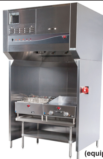
Model WVU-48 (equipment sold separately)