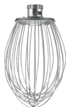
WSM20LW Stainless Steel Chef's Whisk