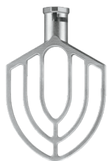
WSM20LMP Aluminum Mixing Paddle