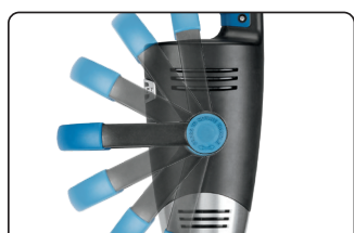
Patented pivoting second handle and comfort grip