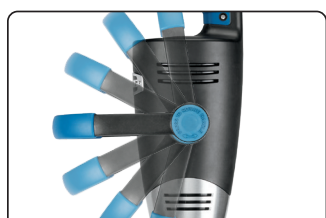
Patented pivoting second handle and comfort grip