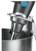
WSBBC Big Stix® Immersion Blender Bowl Clamp