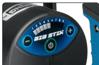
Electronic speed adjustment with LED indicator