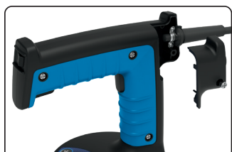
Dual-trigger handle and serviceable cord design