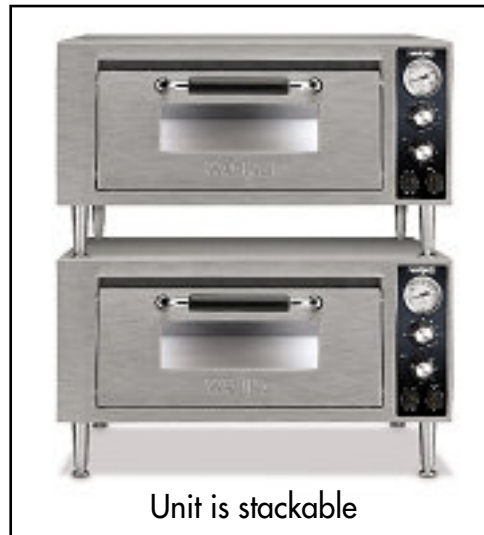
Unit is stackable