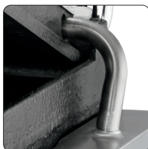
Improved, leveling hinge systems