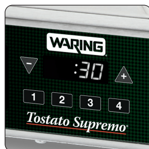
Digital timers with 4 programmable time settings