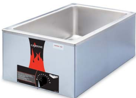
Cayenne® Model 2000 Warmer