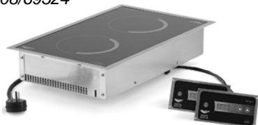
Induction Ranges: Intrigue™ Heavy-Duty Ultra and Professional Series Drop-In