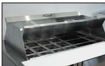
Dual Sided Lids

This product is equipped with a fine mesh filter to the front of the condenser to catch dust, and a rotating brush that moves up and down daily to remove excess buildup outward and away.