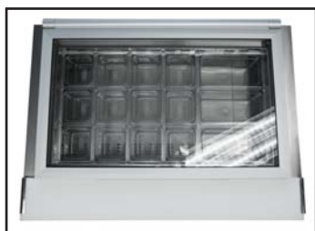
Glass Lid Top