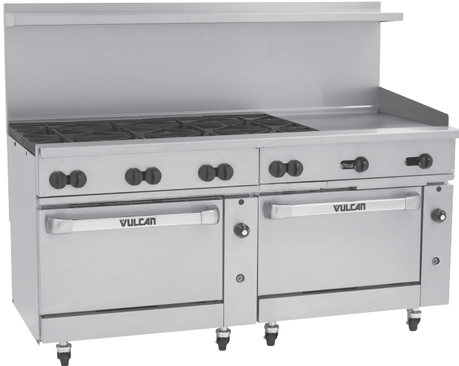
Model 72SC-8B-24G-N (shown with optional casters)