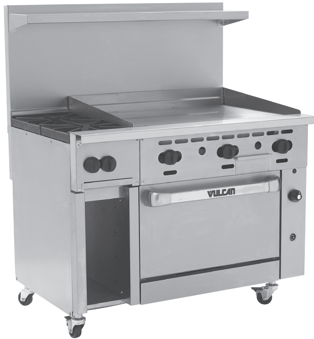
Model 48S-2B36GN (shown with optional casters)