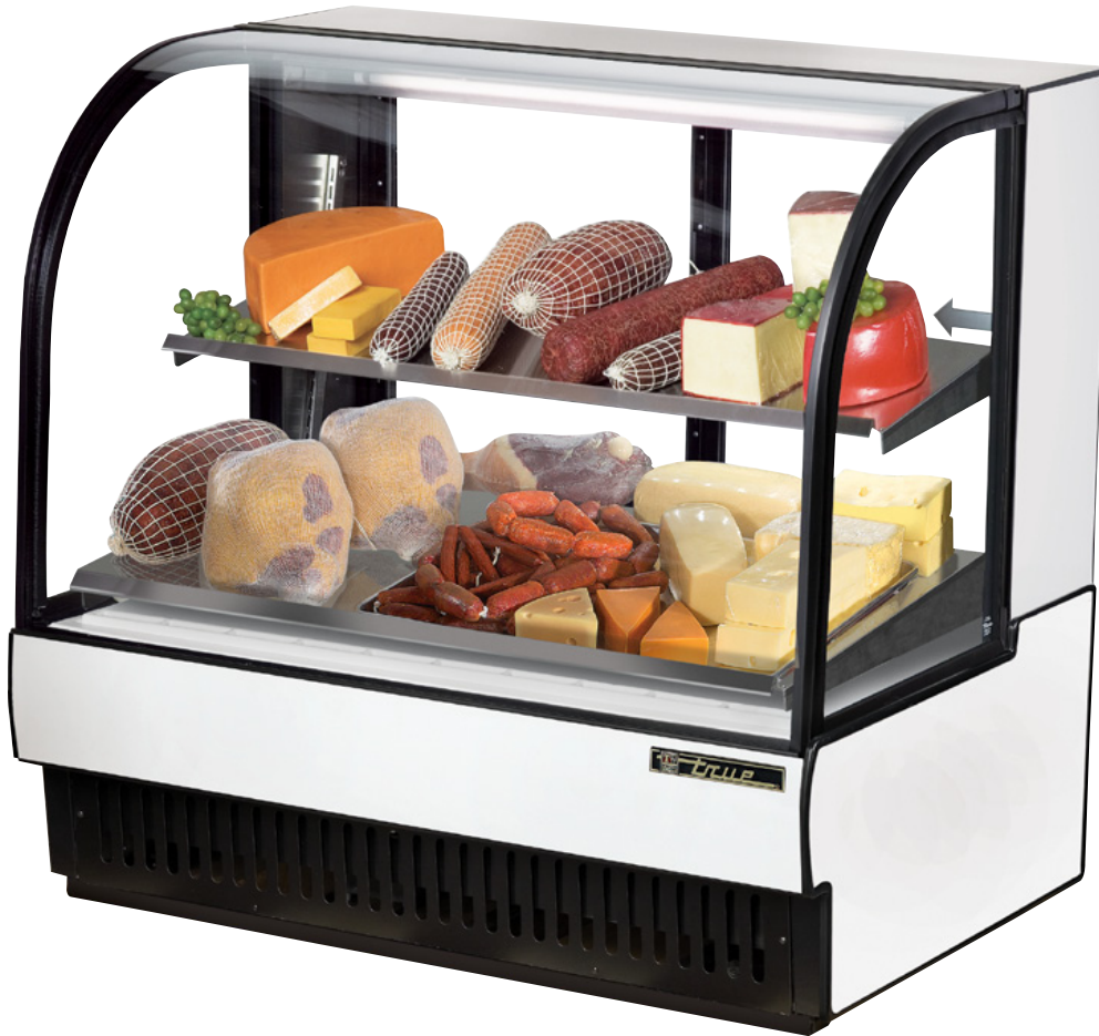
Shown with optional second shelf.

Display Case: Curved Glass Refrigerated Cold Deli Case